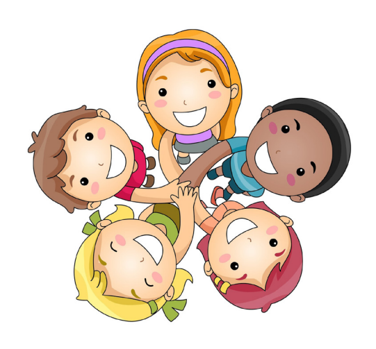
A friend is someone who I like and they like me, too.