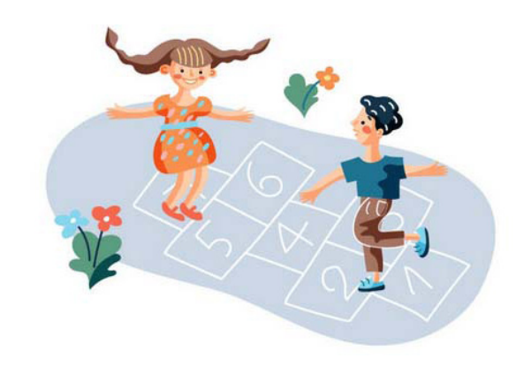
At school, this means that they play with me, sit with me, and talk to me.