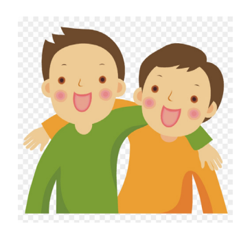
A friend is someone who makes me feel happy.