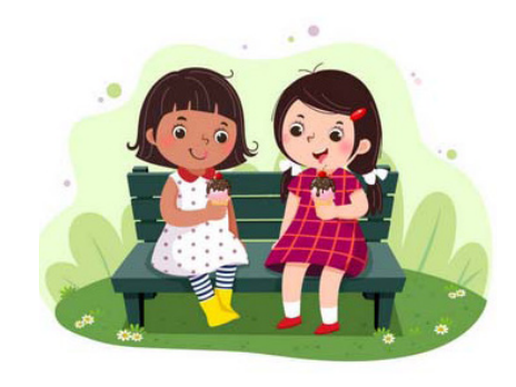
A friend is someone who wants to spend time with me.